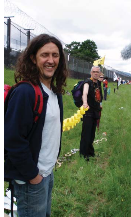
Part of the Peace Chain Around Faslane on 14th June 2008

Remember, the UK Trident system is not really independent. The missiles are leased from the United States and serviced at Kings Bay, Georgia. In practice they are part of a pool of US Trident missiles. The warheads are built in the UK according to US designs